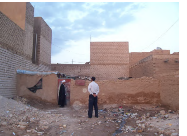
Najaf, Iraq: Home without a ceiling, housing several orphaned children.